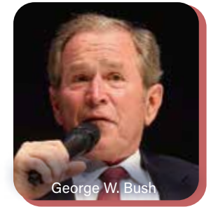
George W. Bush