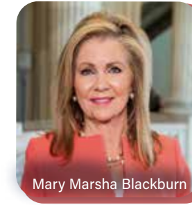
Mary Marsha Blackburn